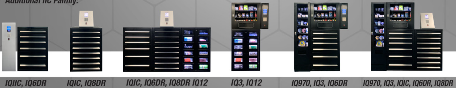
IQIIC, IQ6DR IQIC, IQ8DR IQIC, IQ6DR, IQ8DR IQ12 IQ3, IQ12 IQ970, IQ3, IQ6DR IQ970, IQ3, IQIC, IQ6DR, IQ8DR